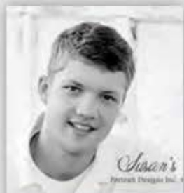
Jacob Newlin Washburn University

WFCU congratulates the recipients of the 2017 Dana Winkler Scholarship. The skills these students have developed, along with their proven commitment to our community, will no doubt lead them toward extraordinary opportunities.